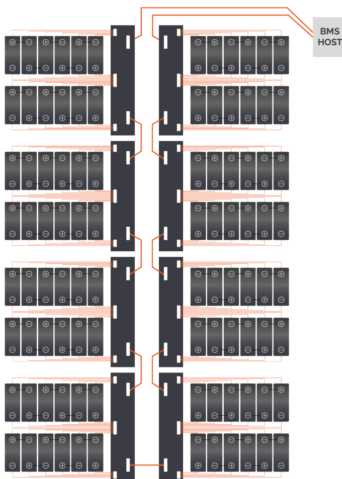
Figure 1: A traditional wired battery design with modularized cell grouping connected to PCBAs, which are respectively wired to the BMS host.

The module-level AFE is populated on a printed circuit board assembly (PCBA). The wire harness/leadframe/FPC connects the module's cell terminals to the PCBA, and a lead frame connects the wire harness to the module's cell terminals, as shown below. The PCBA is often housed in a plastic enclosure and secured with fasteners to mounting brackets. This combination of parts is repeated eight or more times to form the HV battery pack. Finally, another wire harness connects the PCBAs to the BMS via an isolated communications bus, such as an isolated data chain.