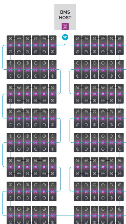
Figure 4: Near field contactless BMS design using Dukosi DKCMS connected to a 3 rd party BMS host

Communication of data between the System Hub and the BMS Host application is enabled by the Dukosi DKCMS API.